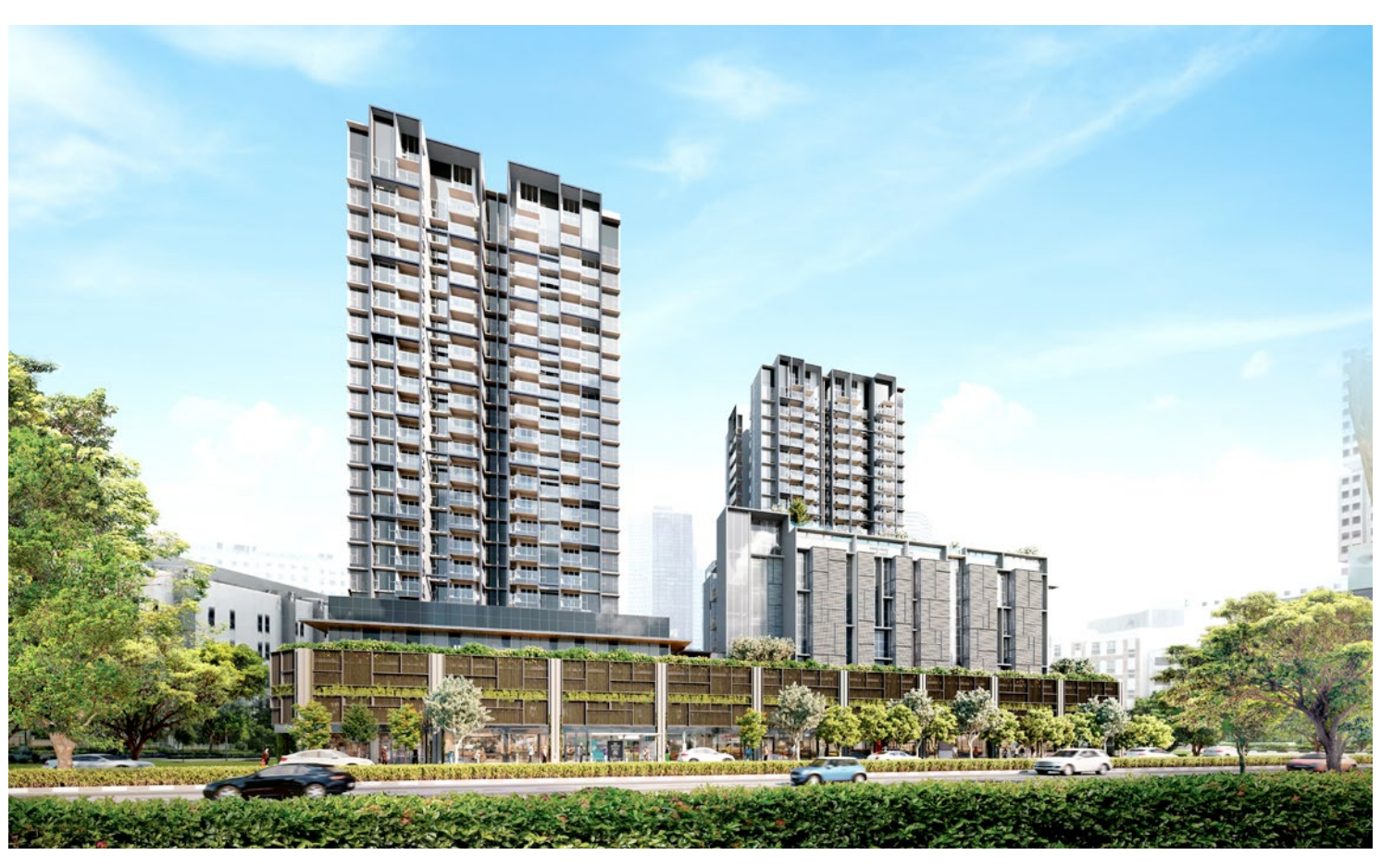
The M at Middle Road, Singapore