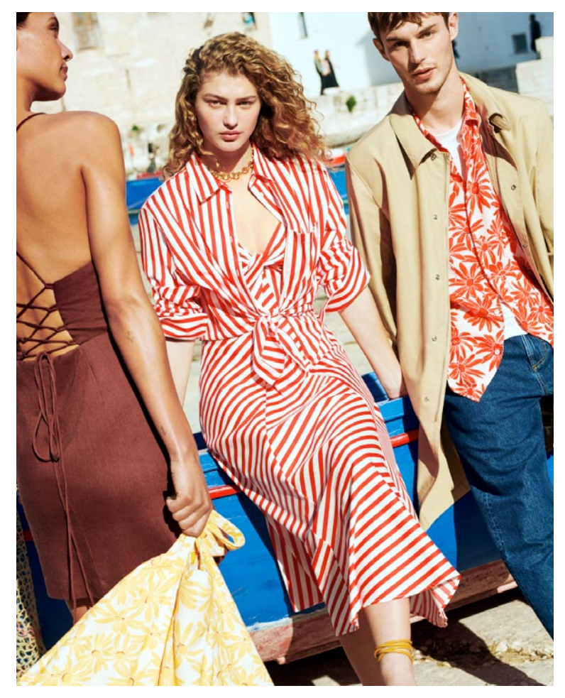
Mango, a Spanish high street brand inspired by the Mediterranean, joined the ranks of Wing Tai's retail portfolio of quality, fashion forward apparel in Malaysia.

Joint venture brand Uniqlo saw steady recovery following the economic reopening of Singapore and Malaysia. It continued to expand its footprint in both markets, operating a total of 28 stores in Singapore and 50 stores in Malaysia as at 30 June 2022. In March 2022, Uniqlo opened its first sustainable and inclusive store in