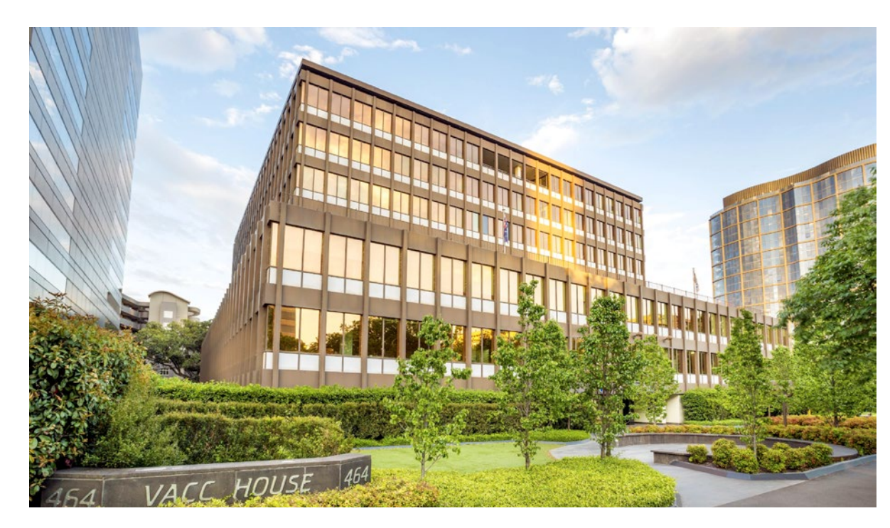
464 St Kilda Road is a freehold 8-storey office building with striking views over Albert Park Lake in Melbourne, Australia.