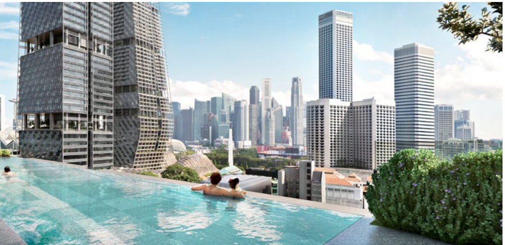
30 June 2022.