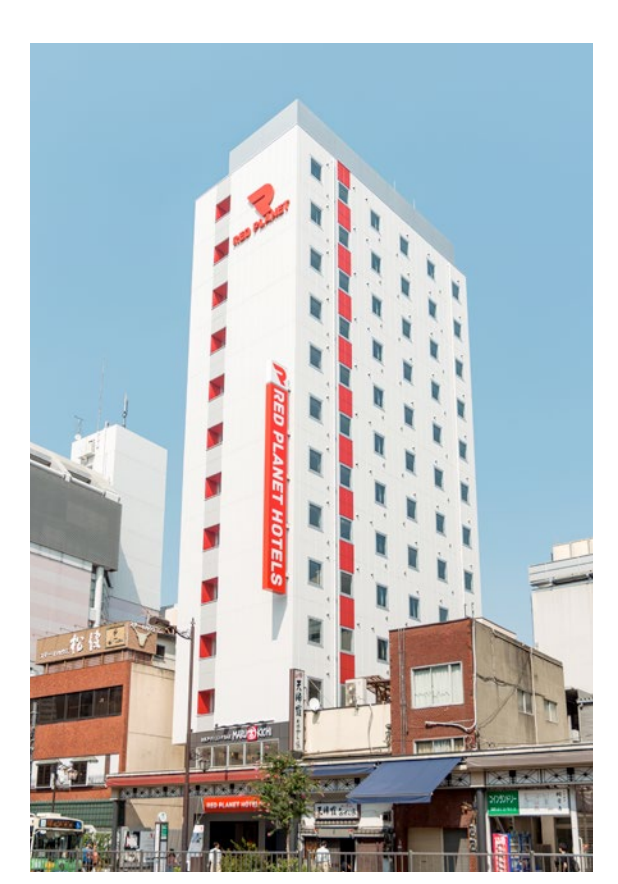
Red Planet Hotel Asakusa is a modern and comfortable hotel that caters to middle-class travellers.

The Group's property business activities in China are conducted through its subsidiary companies, Wing Tai China Pte. Ltd. and Suzhou Property Development Pte Ltd. In Suzhou, work for Phase 2 of The Lakeside comprising 24 units of terraced houses is in progress, and the project is expected to be completed in 2023.