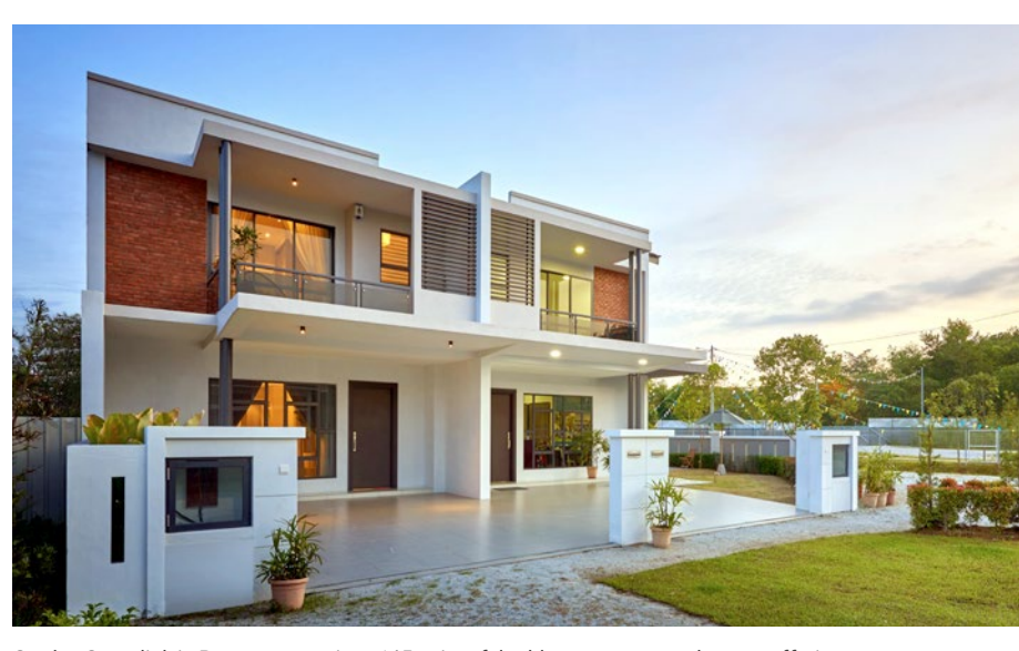
Garden Superlink in Penang comprises 145 units of double-storey terrace houses offering extended features for the whole family, including generous green spaces for gardening.

The occupancy rate for Lanson Place Bukit Ceylon Serviced Residences in Kuala Lumpur remains affected by the nationwide lockdown, although the reopening of borders has provided positive momentum.